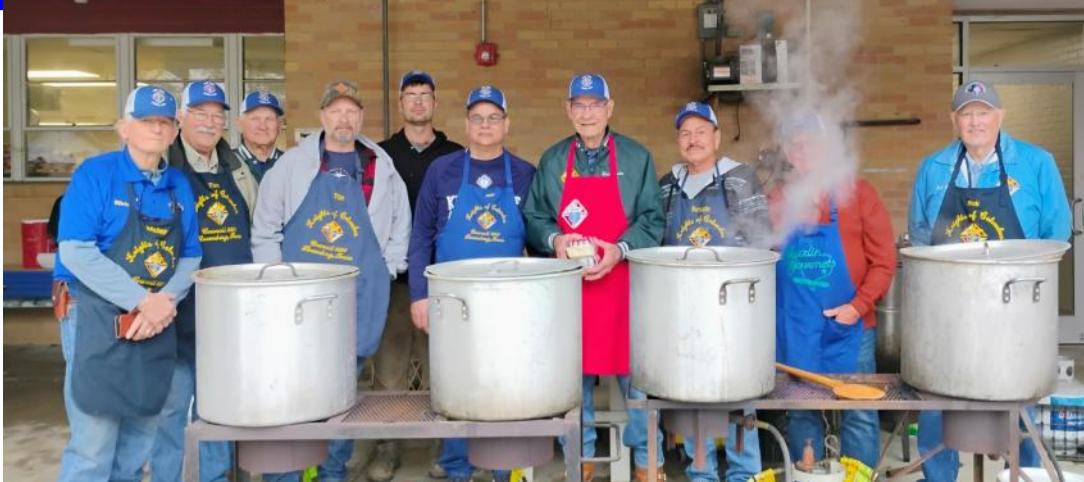
Left: Brother Knights supporting Catholic Daughters during the January Turkey Dinner at Holy Rosary.