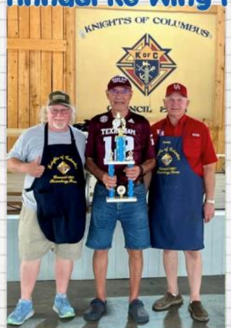
1st Place Open Silver Wings