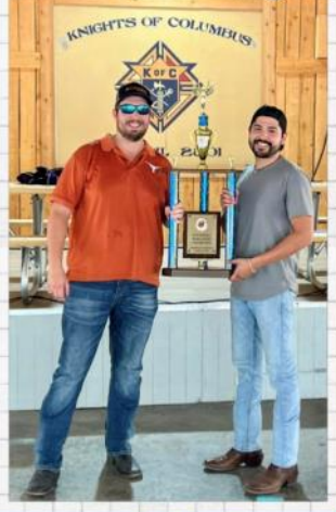
Overall Winner Blazin' Young Guns