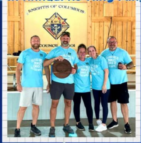
People's Choice Gettin' Sauced