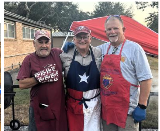
Left: HRCC Bazaar